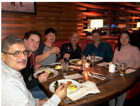
(At the Instructor’s Dinner)